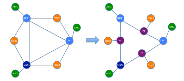
Figure 3. CRF for an example image with 2 object detections and 1 stuff detection. Left shows original CRF with trinary potentials. Right shows CRF reduced to pairwise potentials by introducing z variables with domains covering all possible triples of the original 3-clique.

objects, modifiers, and their spatial relationships, and generates sentences to fit these constituent parts, as opposed to retrieving sentences whole.