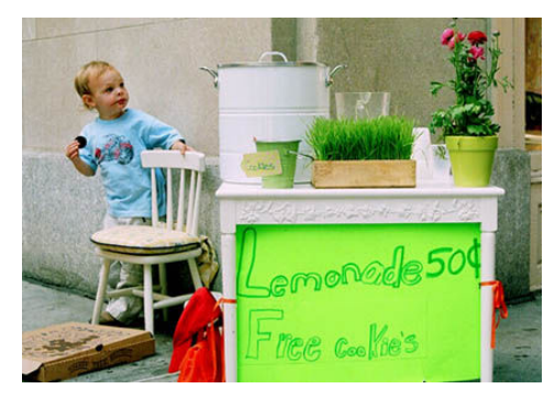
Figure 1. Our system automatically generates the following descriptive text for this example image: "This picture shows one person, one grass, one chair, and one potted plant. The person is near the green grass, and in the chair. The green grass is by the chair, and near the potted plant."

It is subtle, but several factors distinguish the task of taking images as input and generating sentences from tasks in many current computer vision efforts on object and scene recognition. As examples, when forming descriptive language, people go beyond specifying what objects are present in an image – this is true even for very low resolution images [23] and for very brief exposure to images [11]. In both these settings, and in language in general, people include specific information describing not only scenes, but specific objects, their relative locations, and modifiers adding additional information about objects.