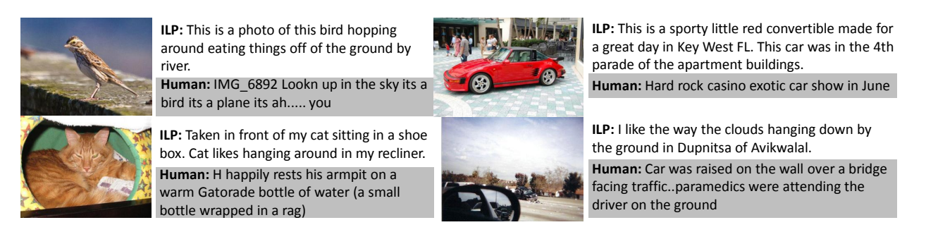
Figure 2: In some cases (16%), ILP generated captions were preferred over human written ones!

the objective function (Eq. 12). Via F_{sijpq} , we aim to quantify the degree of syntactic and semantic cohesion across two phrases x_{sij} and x_{spq} . Note that we subtract this cohesion score from the objective function. This trick helps the ILP solver to generate sentences with varying number of phrases, rather than always selecting the maximum number of phrases allowed.